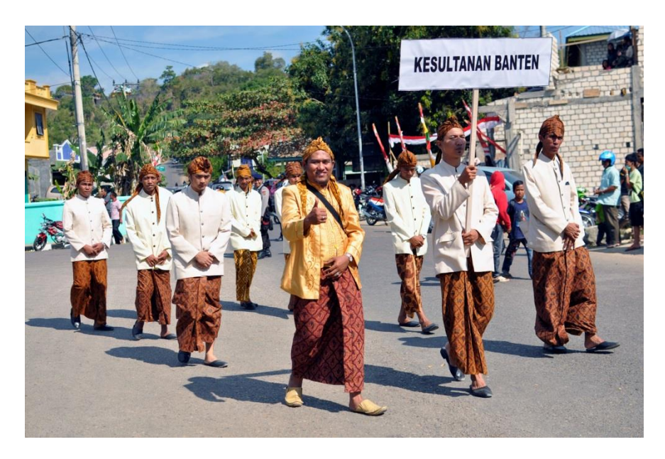
Delegates from Banten Sultanate at the Nusantara Keraton Festival in Buton, 2012.

place on May 19, 2012, at batu popaua , the most sacred spot in the palace compound. The election and inauguration of La Ode Muhammad Ja'far as the new sultan of Buton remained controversial. Some Butonese aristocrats refused to acknowledge the sultan, claiming that since the adat council was illegitimate, its decision was, therefore, an unlawful violation of adat . However, the majority of the aristocrats had chosen to remain passive and made no effort to resist the newly appointed sultan.