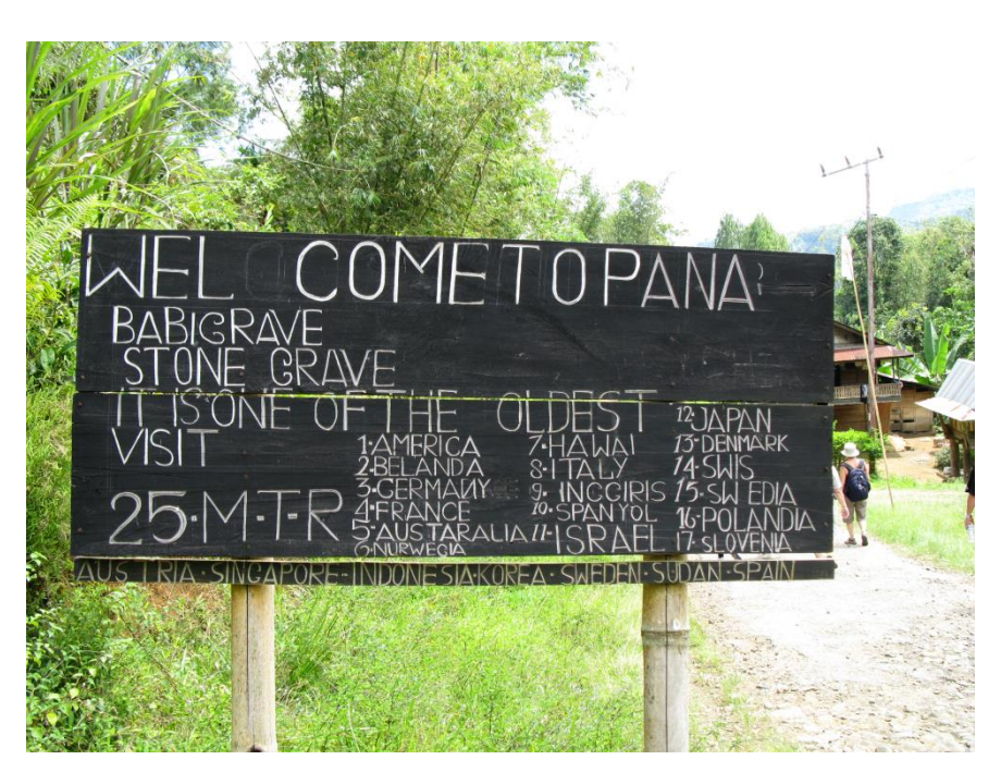
Pana, a hamlet which is not officially recognised as a "tourist object", boasts of the global tourist attention it nevertheless attracts.

1984b:191). It was the economic promise of tourism which brought new recognition to these "backward" structures and practices.