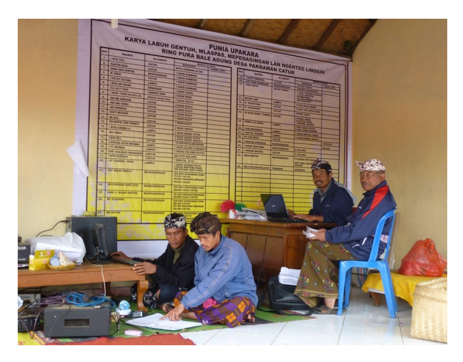
Modern technology plays an important role in today's organisation of AMAN Bali, as well as of adat temple ceremonies (here, doing the accounts in the temple Bale Agung in Catur village after its sumptuous renovation and elaborate rituals).