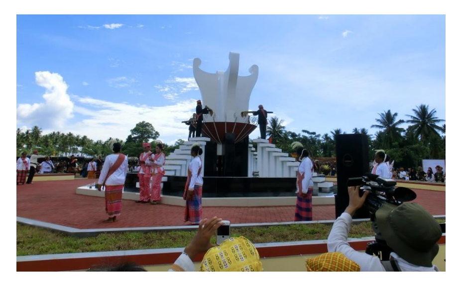
The monument Air Nusantara in Tobelo. Holy water from all over Indonesia was merged in the monument during the opening ceremony of KMAN IV in April 2012. Tobelo activists borrowed from Hibua Lamo philosophy in its construction, especially the importance of the number eight and the cardinal points. Photo: Serena Müller 2012

he classifies as traditional.<sup>10</sup> As it is constructed around a big open space, it can be used for meetings, such as workshops during KMAN IV. The position as an adat activist is complemented by his membership of North Halmahera's parliament.<sup>11</sup>