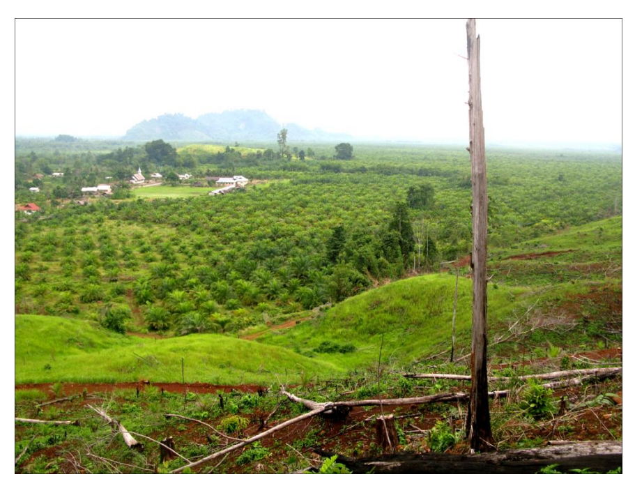
Taronggo is located within an ocean of oil palms.