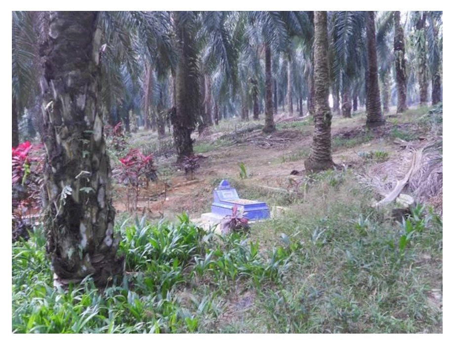
Batin Sembilan graveyard inside PT AP oil palm plantation.